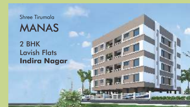
Shree Tirumala MANAS 2 BHK Lavish Flats Indira Nagar