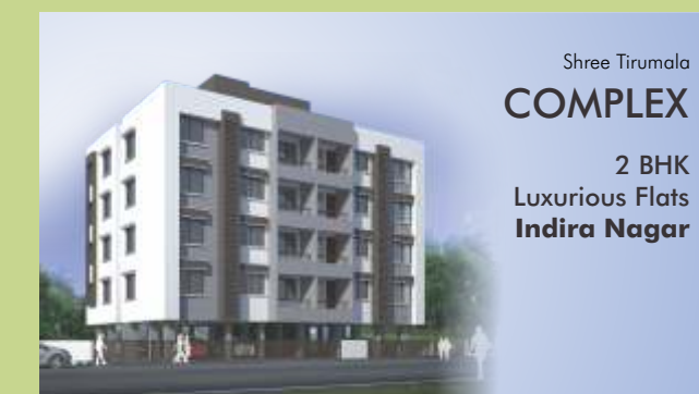
Shree Tirumala COMPLEX 2 BHK Luxurious Flats Indira Nagar