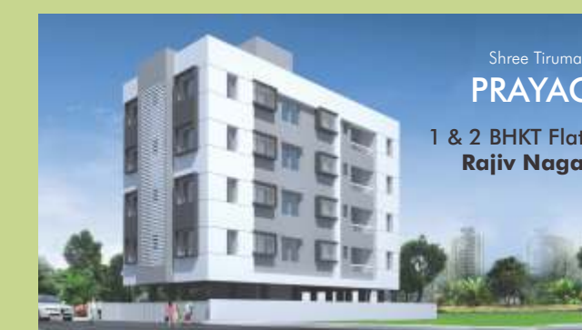
Shree Tirumala PRAYAG 1 & 2 BHKT Flats Rajiv Nagar