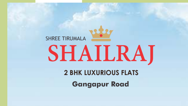
SHREE TIRUMALA SHAILRAJ 2 BHK LUXURIOUS FLATS Gangapur Road