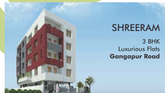
SHREERAM 3 BHK Luxurious Flats Gangapur Road