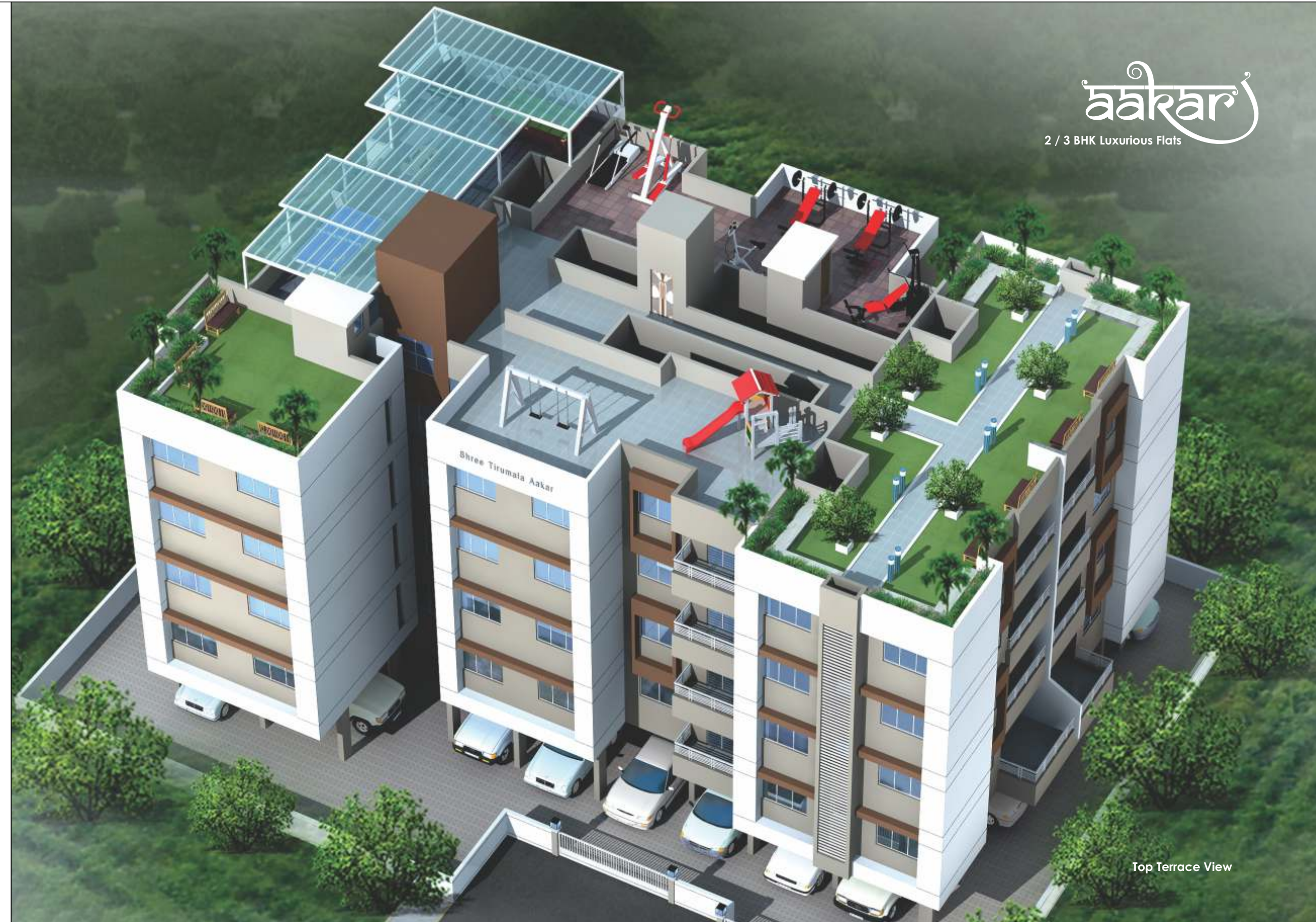
Top Terrace View

Note : The information contained in this brochure such as the plans, specification, images and other details herein are indicative only. The Developer reserves the rights to change any or all of these.