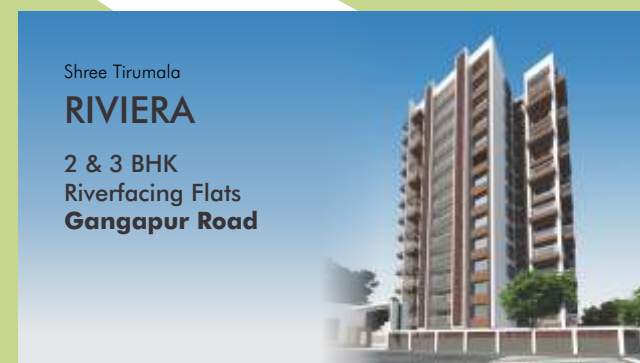
Shree Tirumala RIVIERA 2 & 3 BHK Riverfacing Flats Gangapur Road