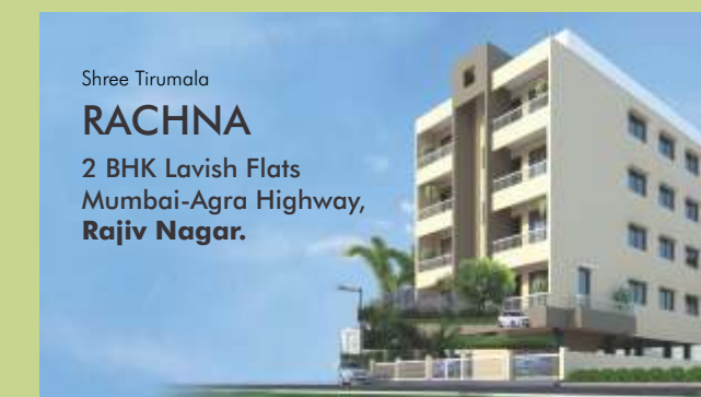
Shree Tirumala RACHNA 2 BHK Lavish Flats Mumbai-Agra Highway, Rajiv Nagar.