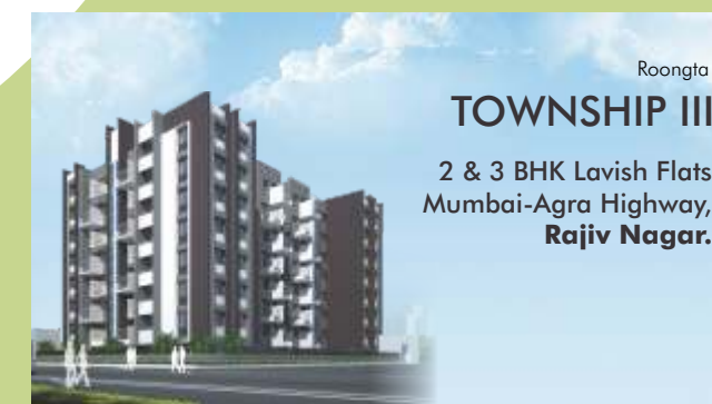
Roongta TOWNSHIP III 2 & 3 BHK Lavish Flats Mumbai-Agra Highway, Rajiv Nagar.