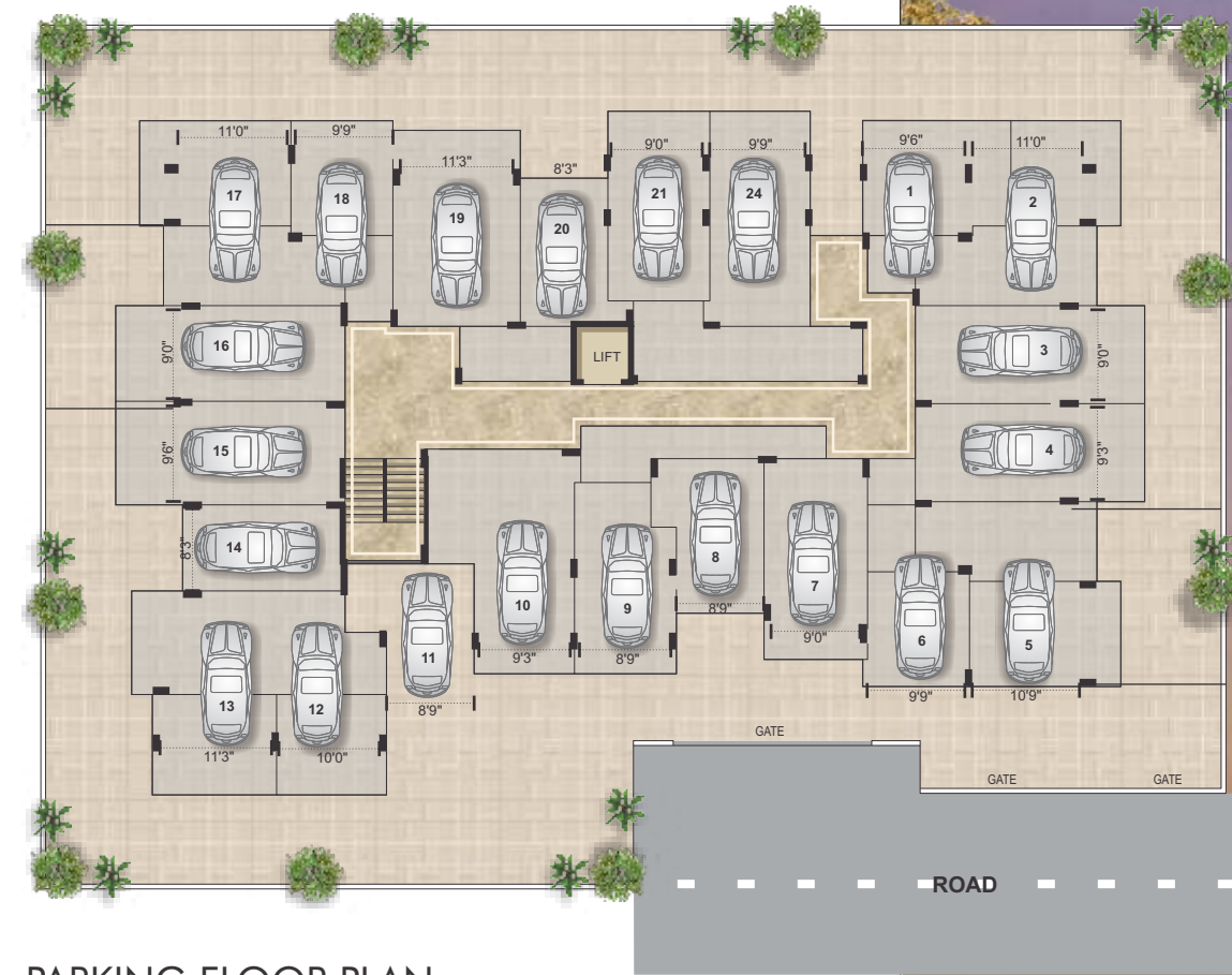
PARKING FLOOR PLAN

Subject to availability of space for parking