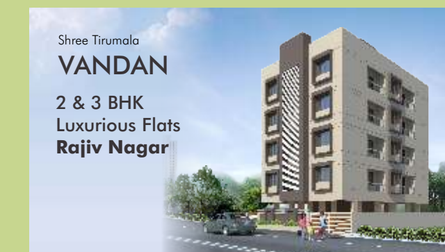
Shree Tirumala VANDAN 2 & 3 BHK Luxurious Flats Rajiv Nagar