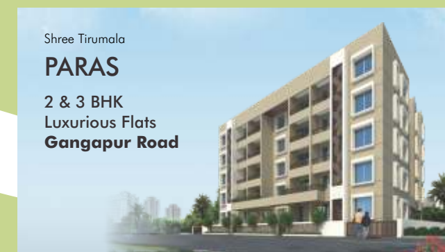
Shree Tirumala PARAS 2 & 3 BHK Luxurious Flats Gangapur Road