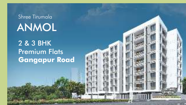
Shree Tirumala ANMOL 2 & 3 BHK Premium Flats Gangapur Road