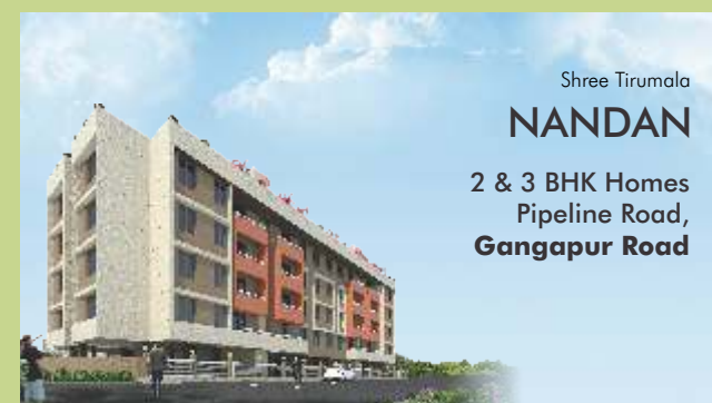
Shree Tirumala NANDAN 2 & 3 BHK Homes Pipeline Road, Gangapur Road