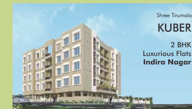
Shree Tirumala KUBER 2 BHK Luxurious Flats Indira Nagar