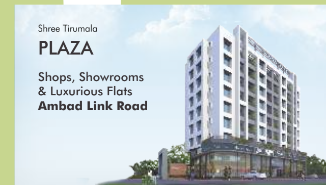
Shree Tirumala PLAZA Shops, Showrooms & Luxurious Flats Ambad Link Road