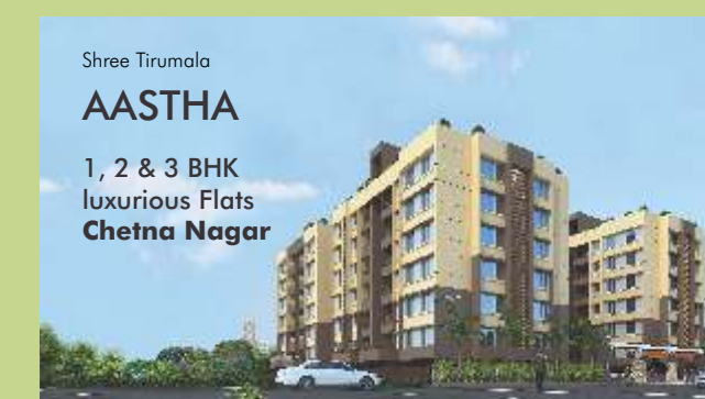
Shree Tirumala AASTHA 1, 2 & 3 BHK luxurious Flats Chetna Nagar